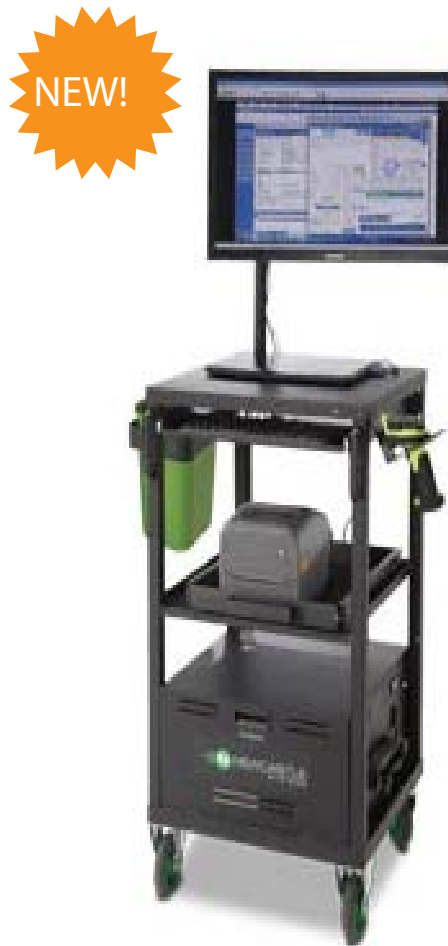
EC Series with PowerSwap Nucleus® MINI Power System

Boost your Dock to Stock Metrics with the EcoCart