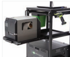
Optional slide-out keyboard tray, printer tray and scanner holder