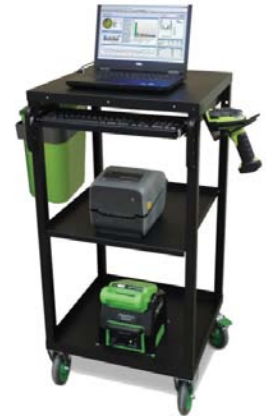
EC Series with PowerSwap Nucleus® MINI power system

All EcoCart Series Mobile Powered Workstations listed below come standard with (one) top shelf, 5" locking casters, push handles, integrated power system and power outlets.