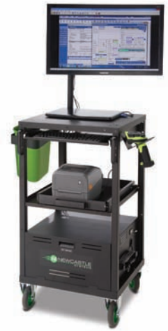
EC Series shown with optional accessories