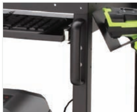
Integrated push handles for easy maneuverability