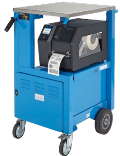
Powered Mobile PrintCart