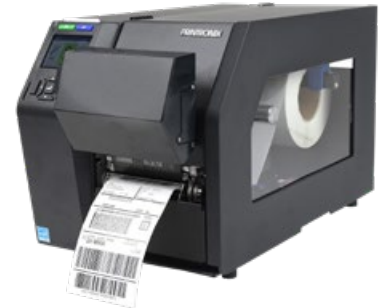
Barcode Verifier (T8000 ODV-2D)